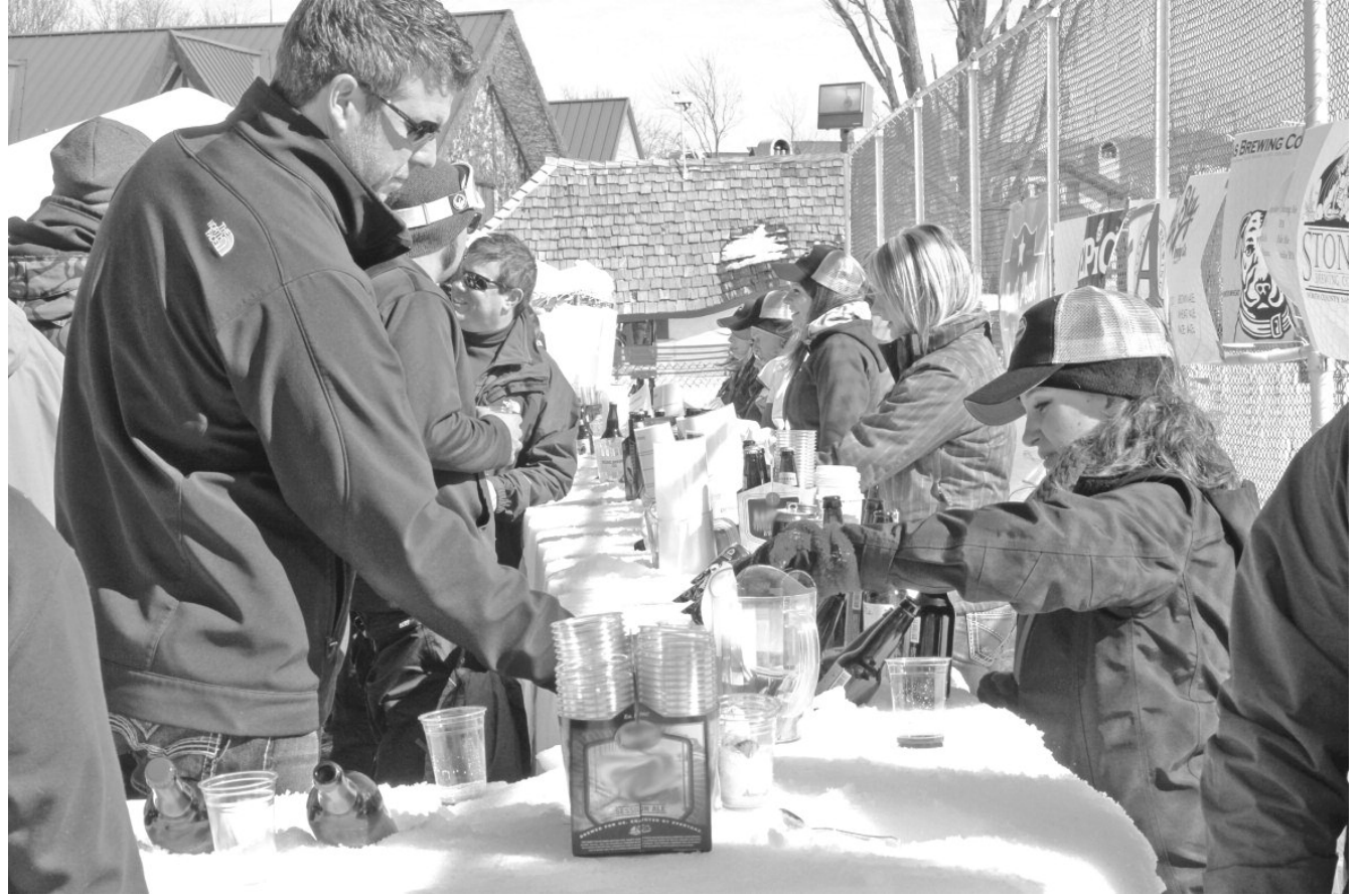
The 4th Annual Brew-Ski Festival will take place at Boyne Highlands Resort this Saturday, March 9th, featuring craft beer sampling, live music, brats on the grill, and the enjoyment of early spring skiing and snowboarding.