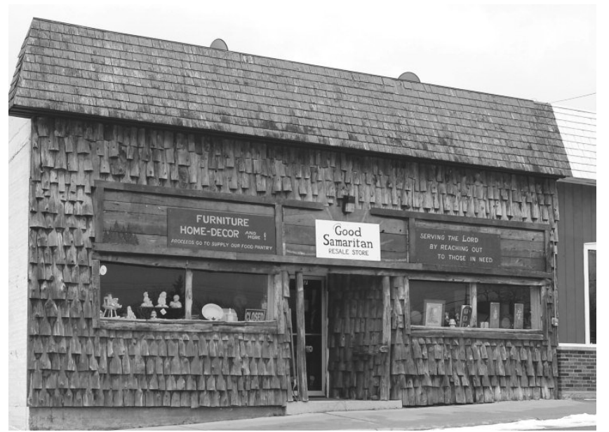
GoodSamFurnPhoto; The approximately 1,800 square foot Good Samaritan Furniture & More showroom at 6517 Center Street in Ellsworth is full of gently used sofas, chairs, tables, dressers, beds, lamps, pictures, household nick-knacks...just about anything imaginable to furnish or decorate the home.

The Good Samaritan Furniture & More Showroom is located on Center Street in Ellsworth diagonally across from the Front Porch Café. The shop is open from 10 am to 4 pm Tuesday through Friday, and from 10 am until 2 pm on Saturday. For further information, call the showroom at (231) 676-3339 or visit www.thegoodsam.org .